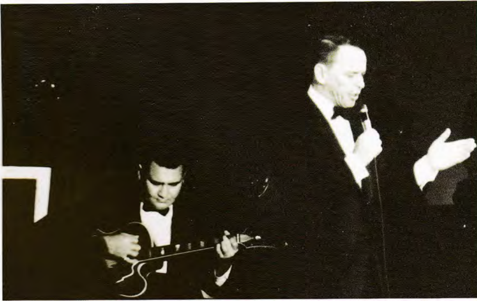
To get into Frank Sinatra's sold-out performance at the 500 Club in Atlantic City, a teenage Boggs dressed as a busboy and entered the Club through the exterior kitchen door. Once the show started, he ditched the duds and watched Ol' Blue Eyes with admiration and awe.